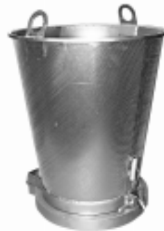
Drop Bottom Style