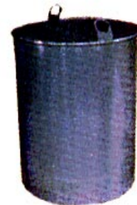
Standard Chip Basket