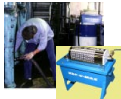
MDL TK, Liquid Only Recovery, 1-2 gallons per second. Fills entire closed top drum