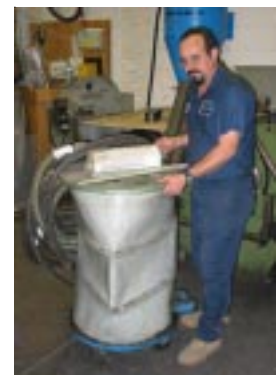
Make Sure your drum is at least 16 gauge