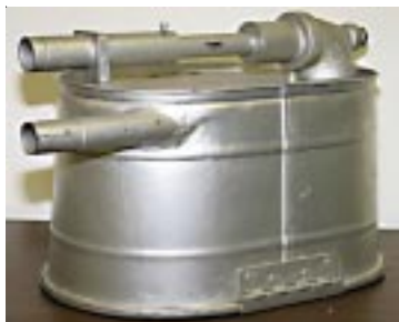
VAC-U-MAX Proto-Type Vacuum Cleaners, Vintage 1954

Vacuum cover fits any standard 16 gauge steel open top drum, no clamps required. Gasket seals securely when supply air is turned on, releases instantly when air is turn off.