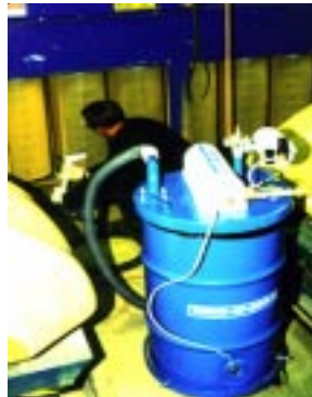
MDL 30 and MDL 55 Powder Paint Recovery makes powder paint booths easy to clean