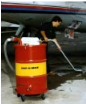
MDL 55-Flammable Liquid Recovery makes sucking up flammable liquids safe